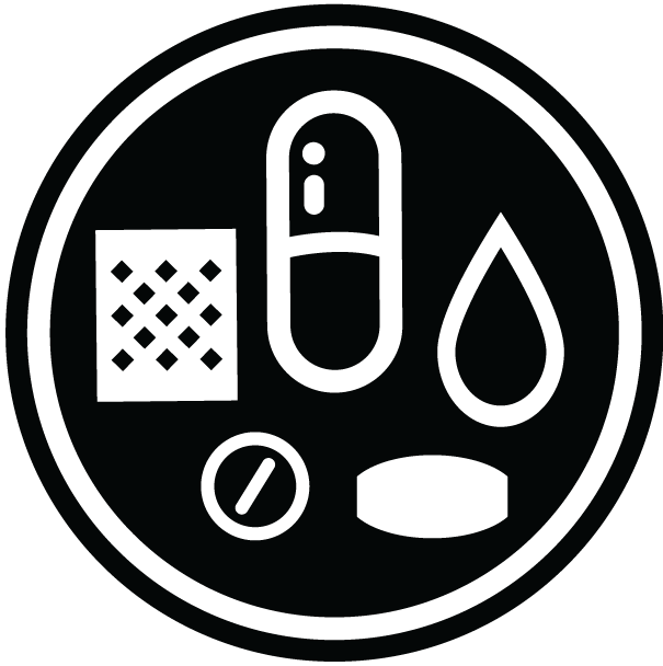
Meds by Form