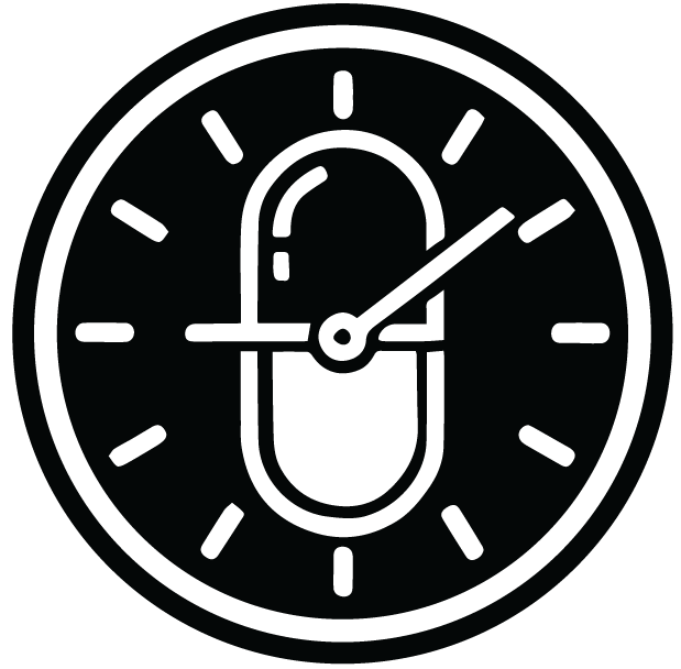
Meds by Duration